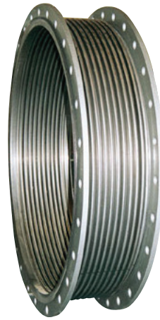
DN 600 - DN 2800